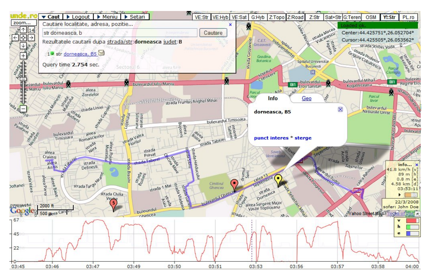
Figure 3: Sample ePH screenshot – graphical car tracking and POI search result