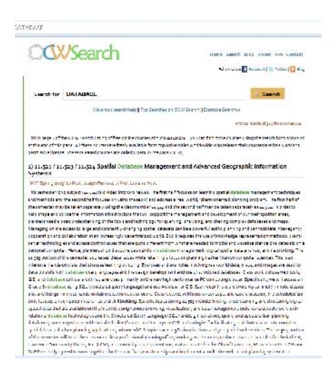
Figure 3. Far's OCW Search Engine: home page (left) and a particular search (right)