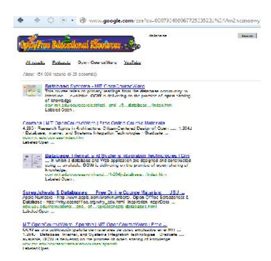
Figure 1. Google Custom OCW/OER Search

In this section we overview the most well-known OCW/OER custom search opportunities either sustained by organizations or companies or by individuals (we particularize our search using the word "database"). First, there is Google Custom Search that may be adapted for OCW/OER Search. Users may create their own search engine that is focused on particular subjects and acts on websites chosen by the creator of the custom search engine. This custom search engine may be accessed from any webpage where is attached. So, users may use the custom search created by others or create their own (see Z. A. Alsagoff's in Fig. 1) [37]. The horizontal menu allows various selections, namely users may select only resources that are open courseware, or that contains podcasts (the results under which appear the text "labeled podcasts" actually point to a podcast resource, while the others only contain the search term "podcast").