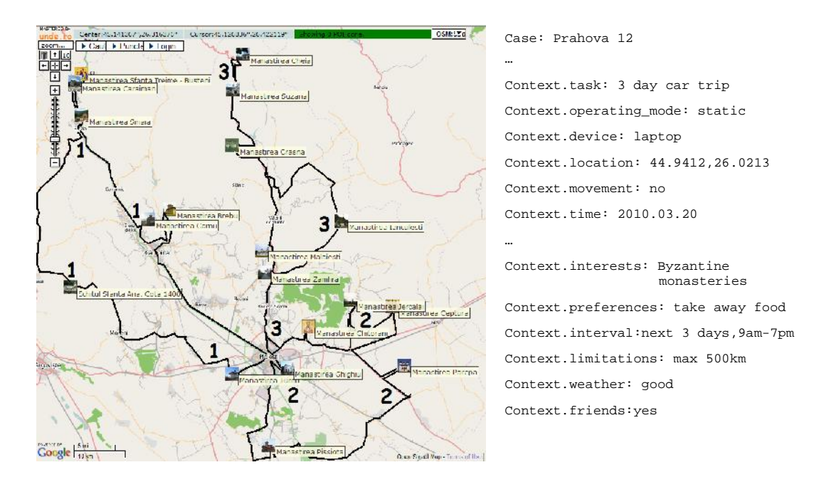
Figure 3. One possible learning scenario and the related prototypical case